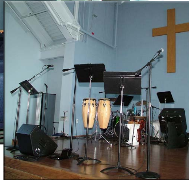
Praise Team's Area: Floor pockets keep the cabling neat and allow for versatility for either vocalists or instruments.

The folks at Grace Lutheran took advantage of both our extended warranty and preventive maintenance service as well as extra training sessions for their operators.