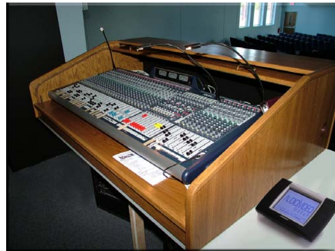
The Audio Console: is located in the sound booth in the back of the room and features a Soundcraft mixer. The video elements are controlled from an adjacent position in the same location.

"It's a true gift to be able to communicate technical ideas so everyone in the process has the same level of understanding. We had a lot of expectations and questions about the new systems. We got solid, honest answers, and the final decisions we made together lead to an incredible room of sight and sound." — Erik Piisila